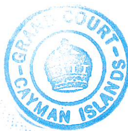
HONOURABLE MR JUSTICE IAN RC KAWALEY JUDGE OF THE GRAND COURT